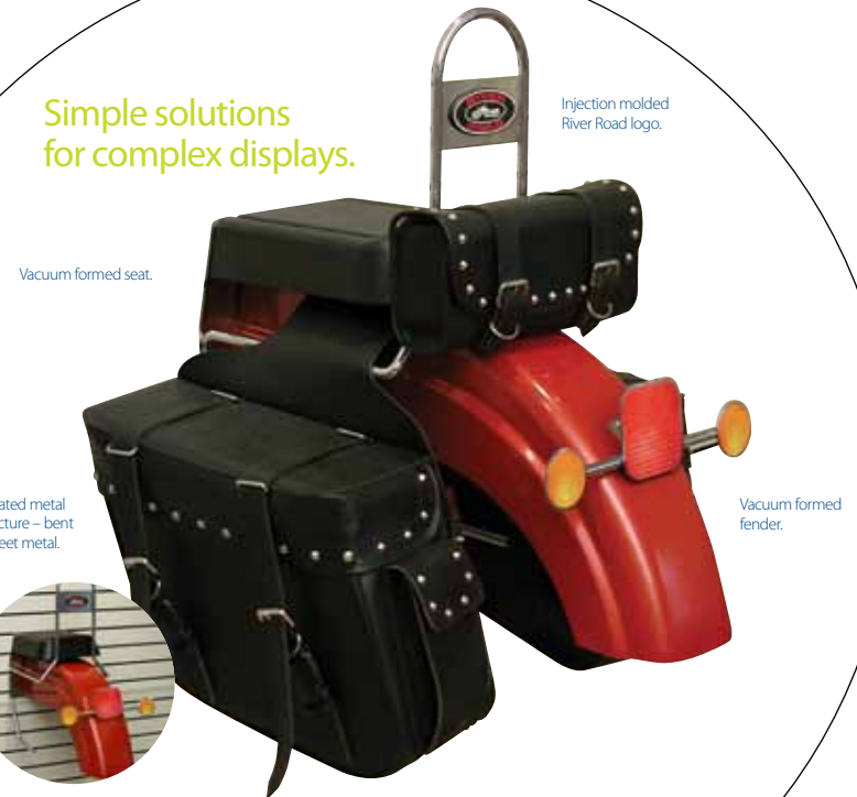
Injection molded River Road logo.